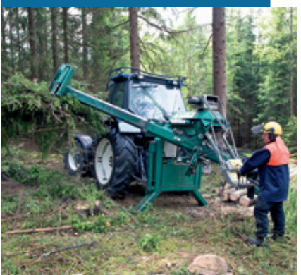
Branches and brushwood can easily be moved out of the way by using the limbing knives as grapples