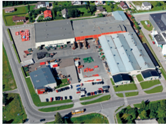
The Fors MW factory is designed for short series production. It is located in Saue, 15 km from Tallinn, Estonia. The production area covers 40,000 m 2 , 18,000 m 2 of which is under roof.

sectors. The nature of the work varies and is performed under different conditions. But there is always one thing in common; the need for reliable products to keep the business working. By listening and taking note of market needs, we are building the market of the future.